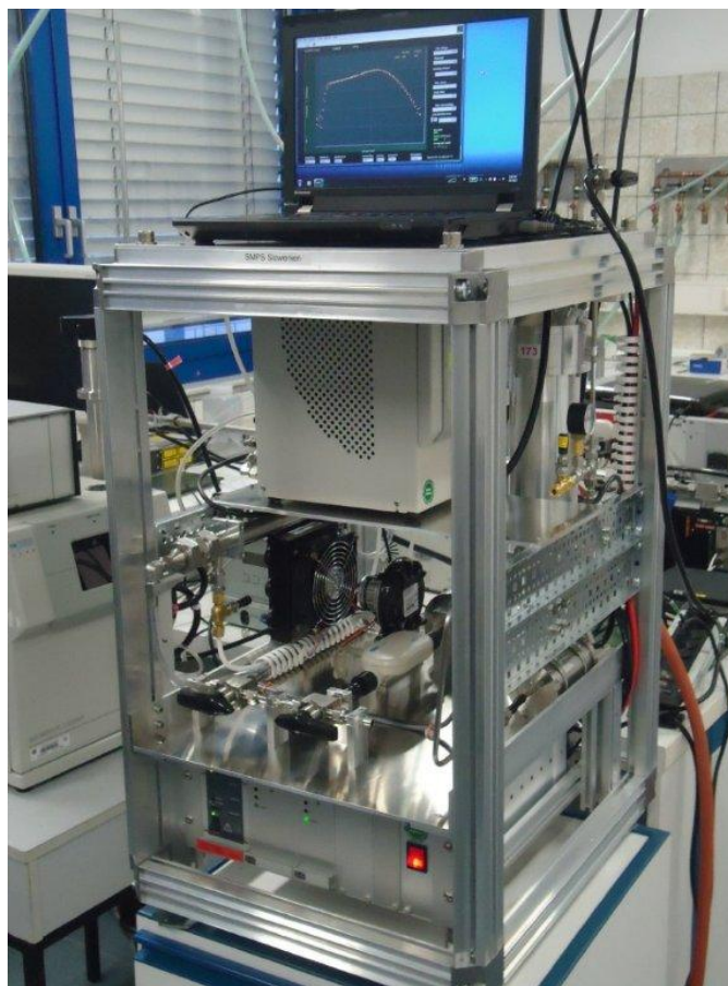
Particle Mobility Size Spectrometers

The WCCAP is a facility at the Leibniz Institute for Tropospheric Research in cooperation with the Federal Environment Agency of Germany and the World Meteorological Organization (WMO). The WCCAP is funded by the Environment Agency of Germany as well as by scientific projects.