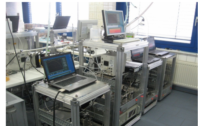
Intercomparison workshop at the WCCAP

The WCCAP performs frequently intercomparison workshops of physical aerosol instruments. Especially, particle mobility size spectrometers, integrating nephelometers, and absorption photometers have a high priority.